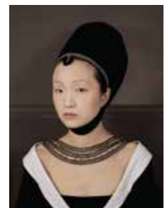
Ode to Petrus Christus' Portrait of a Young Woman