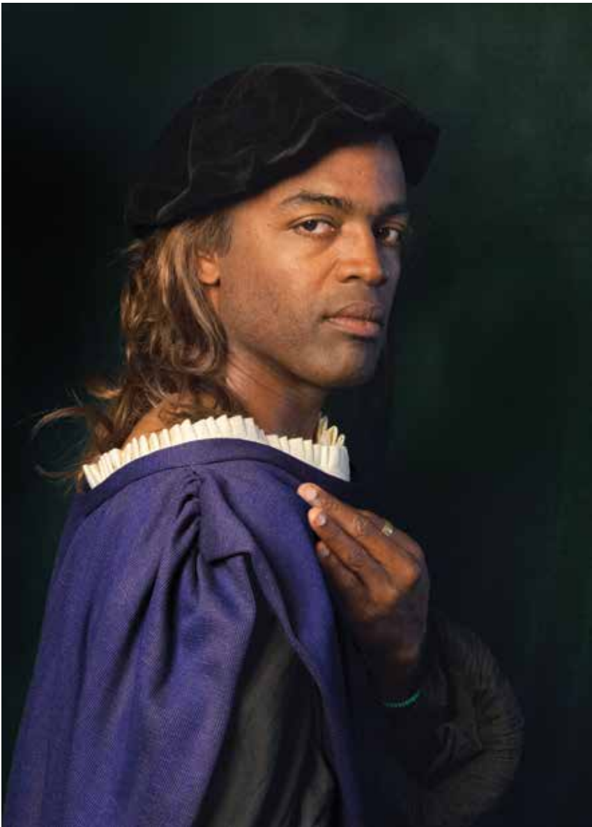
Ode to Raphael's Bindo Altoviti