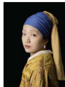
Ode to Vermeer's Girl with a Pearl Earring