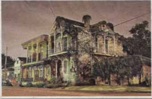
'Brainard,' 2006, by Frank Relle.