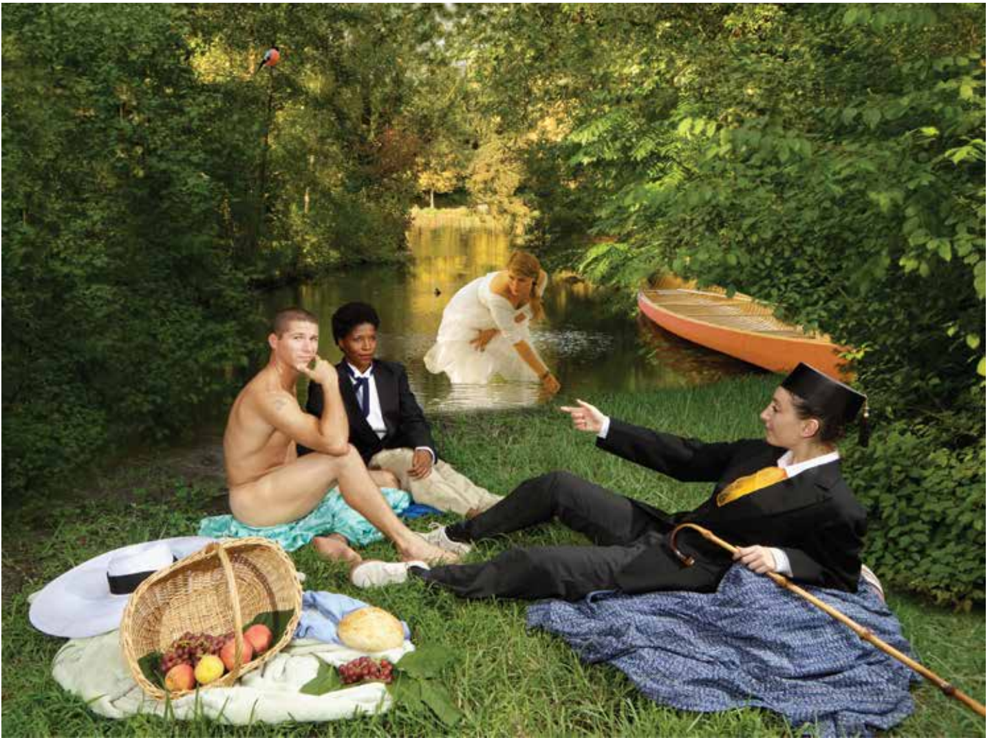
Ode to Manet's Déjeuner sur l'herbe