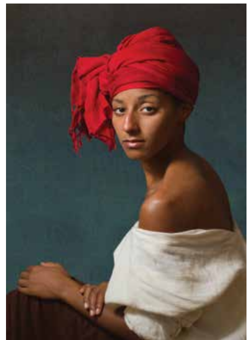
Ode to Amans' Creole in a Red Headdress