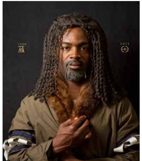
Ode to Durer's Self-Portrait 1500