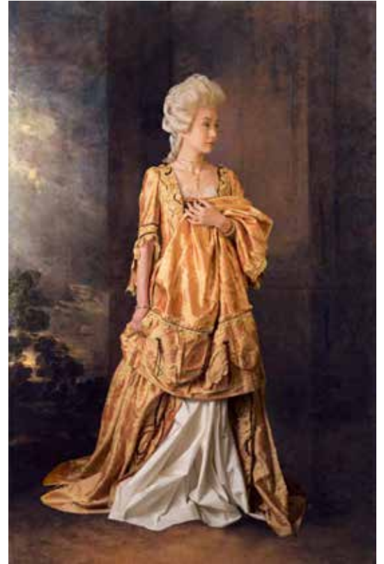
Ode to Gainsborough's Portrait of Mrs. Grace Dalrymple Elliot